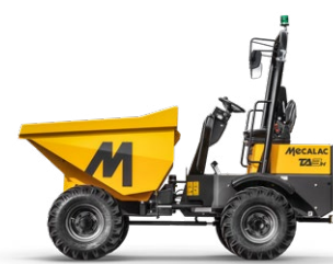
TA3H / TA3SH